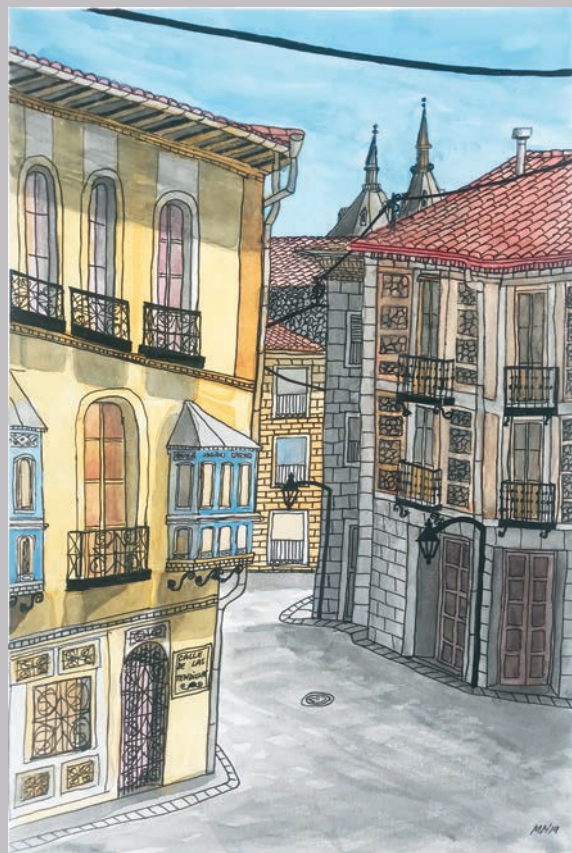
▲ Toledo, Spain